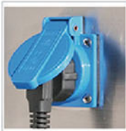
Waterproof Socket 2 waterproof sockets are located in the side panel, for optimum convenience of using small devices inside the cabinet .