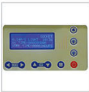
LCD Display Airflow velocity, UV timer, UV work time, system work time, real time.