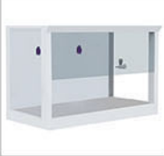
Side Glass Window The transparent side glass windows maximize light and visibility inside the cabinet, providing a bright and open working environment.