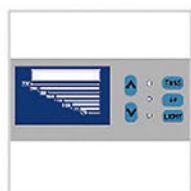
LED Display Microprocessor control system, LED display