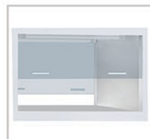
Double Sides Double sides work bench, operators can sit face to face