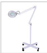
Flex Magnifier Light(Optional)