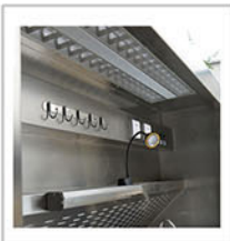
Configuration UV Light; Fluorescent Light; Adjustable Spotlight; Stainless Steel Hanger; "UV, FAN, LIGHT, PULVERIZER" Control.