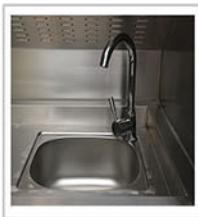
Water Tap & Sink Stainless steel; Whole-structure.