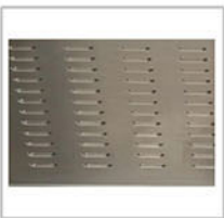
Suction Inlet Suction inlet adopts louver-type. The upper mouthing structure ensures above blower suction, avoiding air back-streaming.