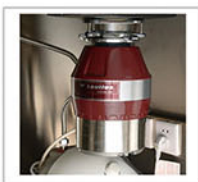
Pulverizer (Optional) Completely smash the waste during test, to avoid blocking drainage pipes.

Pathological sampling bench is widely used in hospital pathology department, pathology laboratory, etc. Reasonable ventilation system protects operator away from the harmful gas produced by the formalin during sampling. The hot & cold water system ensures it can adapt work in different climates.