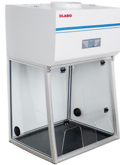
BBS-V700 & BYKG-IX BYKG-X & BYKG-XII