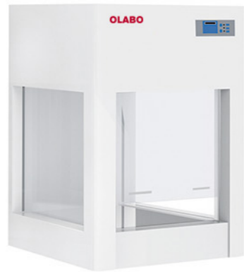
BBS-V500 & BYKG-VII