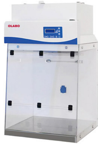
BBS-V600 & BYKG-VIII