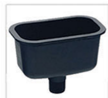
PP Sink resistant to acid, alkali and anti-corrosion