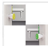
Water&Gas Remote Control