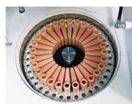
Reagent Tray Refrigerated tray with independent switch.