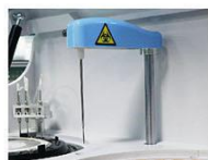
Sample Needle Liquid level sensor function. Anti-collision function. Reagent volume real-time detection.