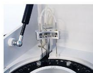
Washing Probe Independent 2-step washing system.