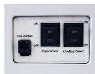
LAN Port Access