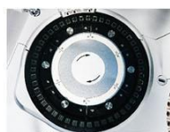
Reaction Tray 37±0.1°C, real-time monitor.